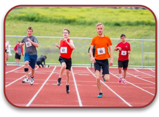
Athletes with Integrity Catalyst for Life