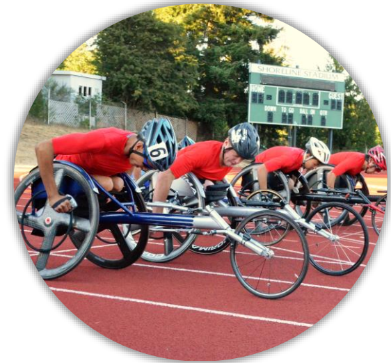
Track & Field