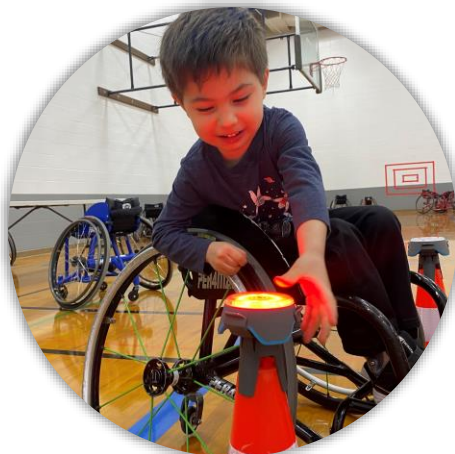
Futures Play Group