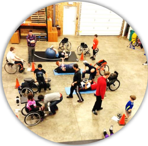
Strength & Conditioning